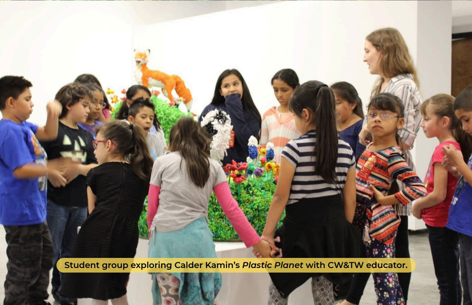
Student group exploring Calder Kamin's Plastic Planet with CW&TW educator.