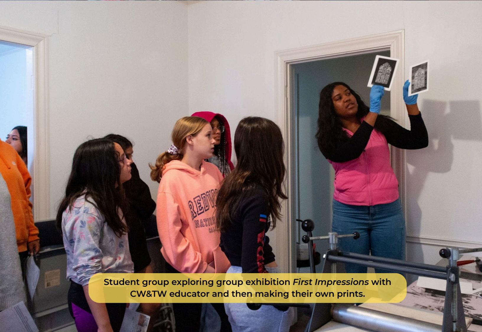
Student group exploring group exhibition First Impressions with CW&TW educator and then making their own prints.