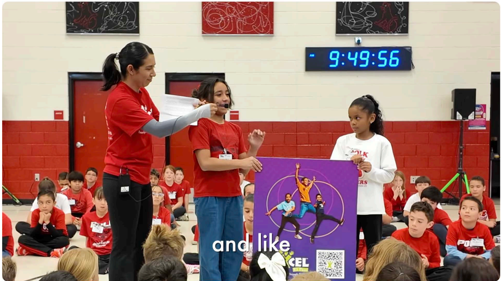
Student Dancer Testimonials (KEEP)