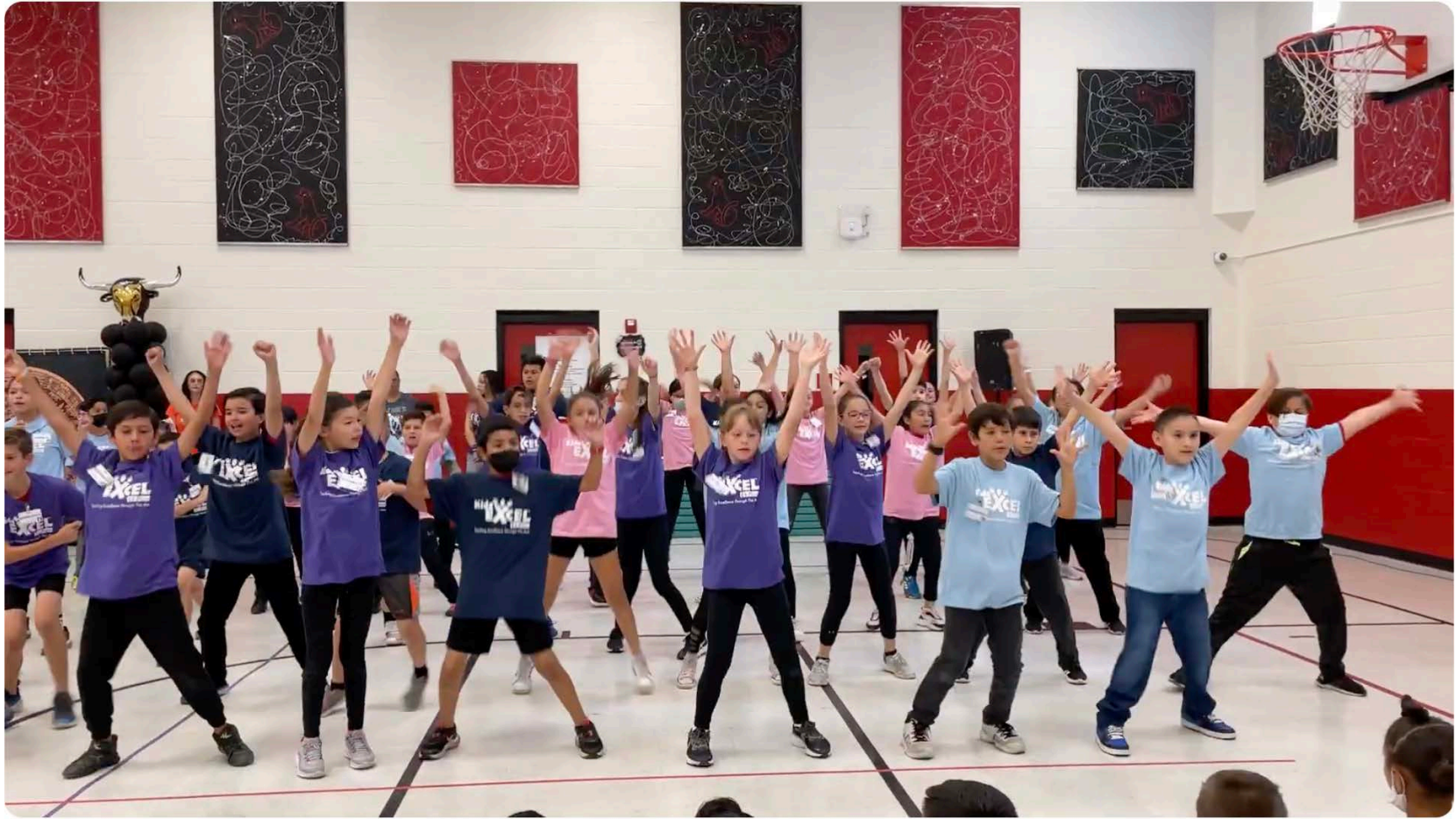
Student Dancers - Finale (KEEP 2022)